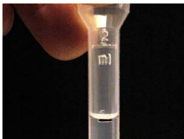
Figure 1. The correct sample eye dropper fill volume is shown. Note that the meniscus is just touching the 1.50 ml graduation.